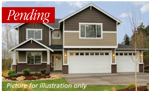
Picture for illustration only